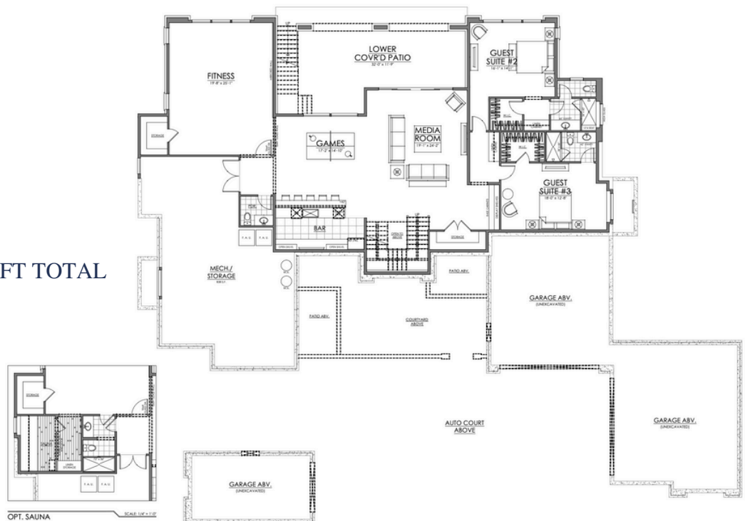
LOWER LEVEL // 2,716 SQFT TOTAL

**This architectural design / floor plan is purely preliminary and subject to change.