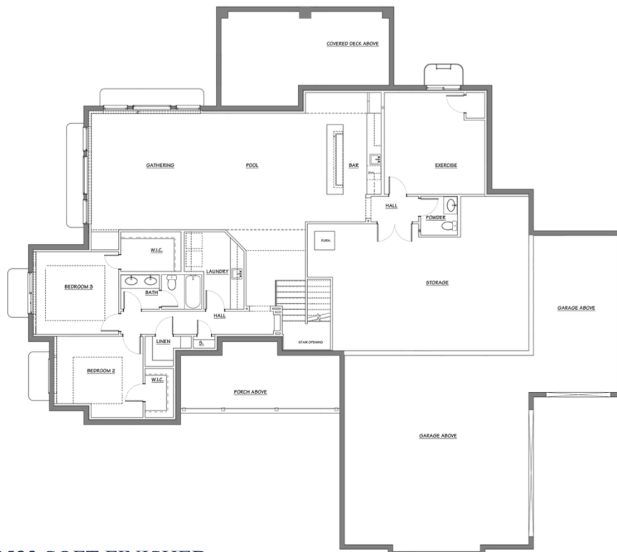
LOWER LEVEL // 2523 SQFT FINISHED