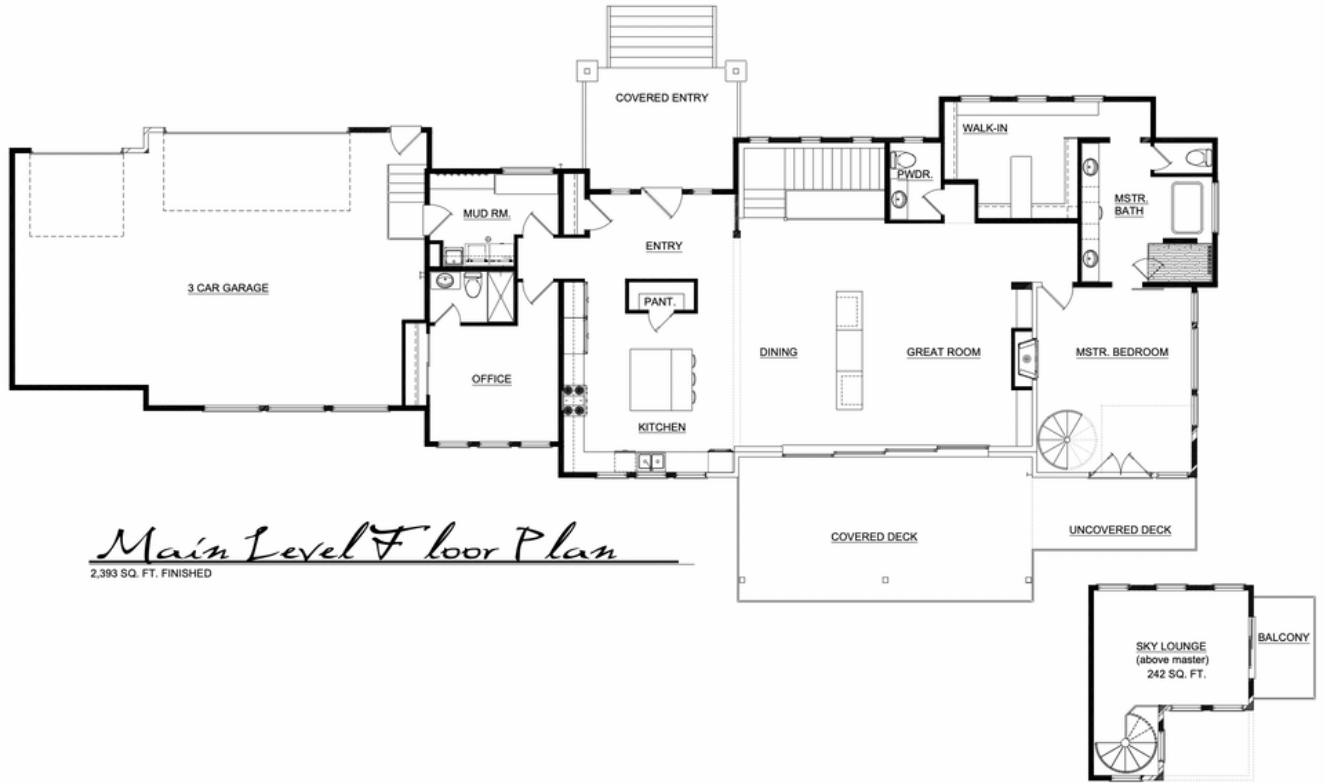
Main Level Floor Plan 2,393 SQ. FT. FINISHED