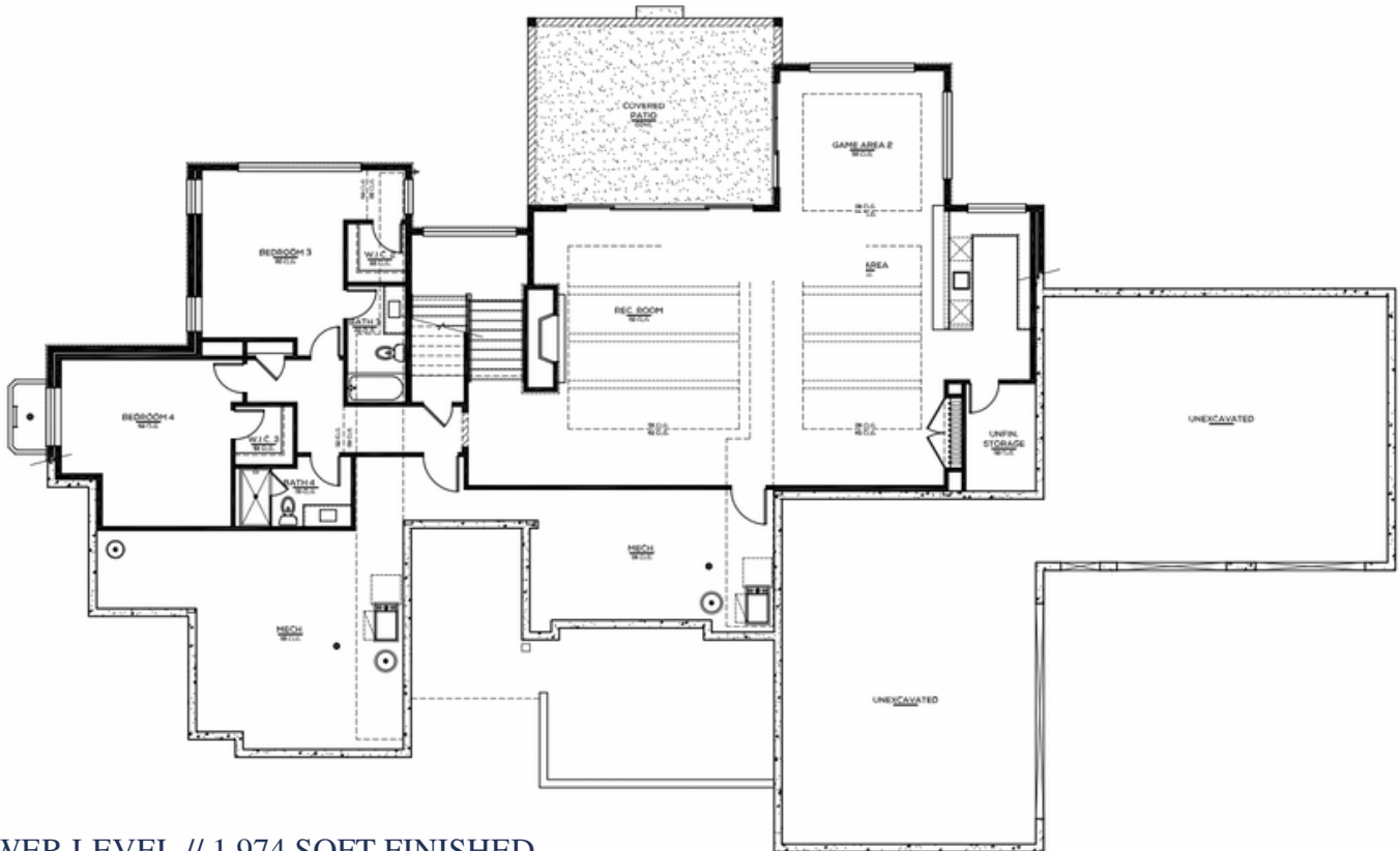
LOWER LEVEL // 1,974 SQFT FINISHED